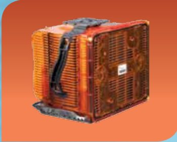
Front Opening Unified Pod