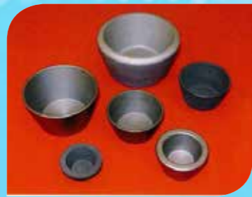
Graphite E-Beam Crucibles