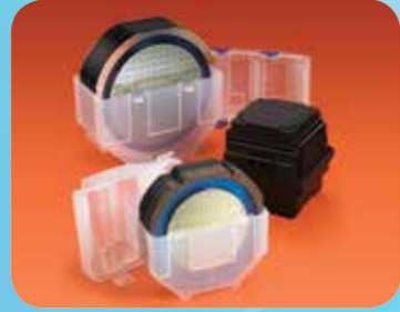
Multiple Film Frame Shippers