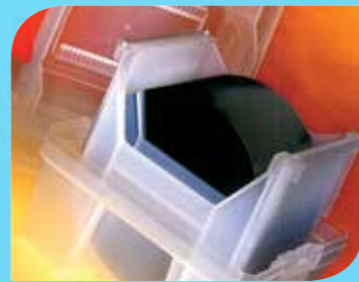
Dummy / Test Wafers