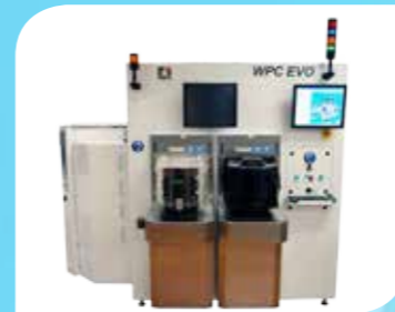
Wafer Packing/Unpacking Equipment