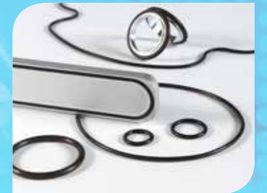
Slit Valve Doors & Centering Rings