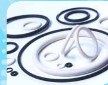
FKM / FFKM O-Rings & Seals