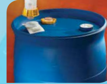
Chemical Dispense System