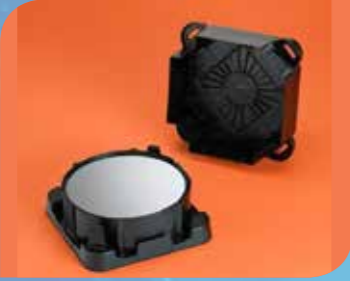
Horizontal Wafer Shipper