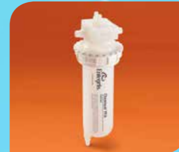
PFA Filter Housing