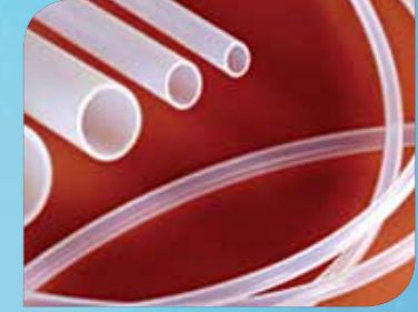
PFA Tubings & Pipes