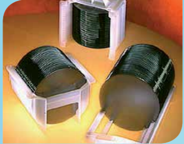
Process Wafer Carriers