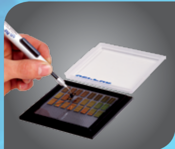
Vacuum Release Tray