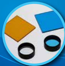
TFT & Optics